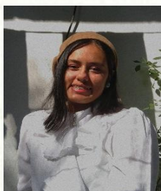
Raidhani III Year Executive Member